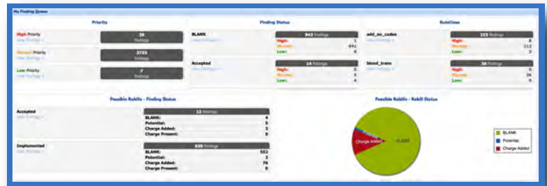
Graphs showing status, implementation, valuation, claim statistics and more are available on the AppRev User Portal.

AppRev's Charge Accuracy Solution combines software with consulting to deliver the most effective charge accuracy solution available.